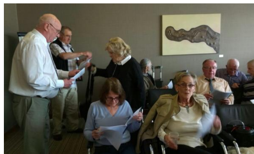
Cork Meeting April 2015

Two national meetings were held in 2015, Cork, and Dublin. At these meetings the groups inputted and planned COPD week and developed a political manifesto to enable engagement with politicians around the general election. Based on this work, the publication of the COPD Manifesto for Government set out the following demands: